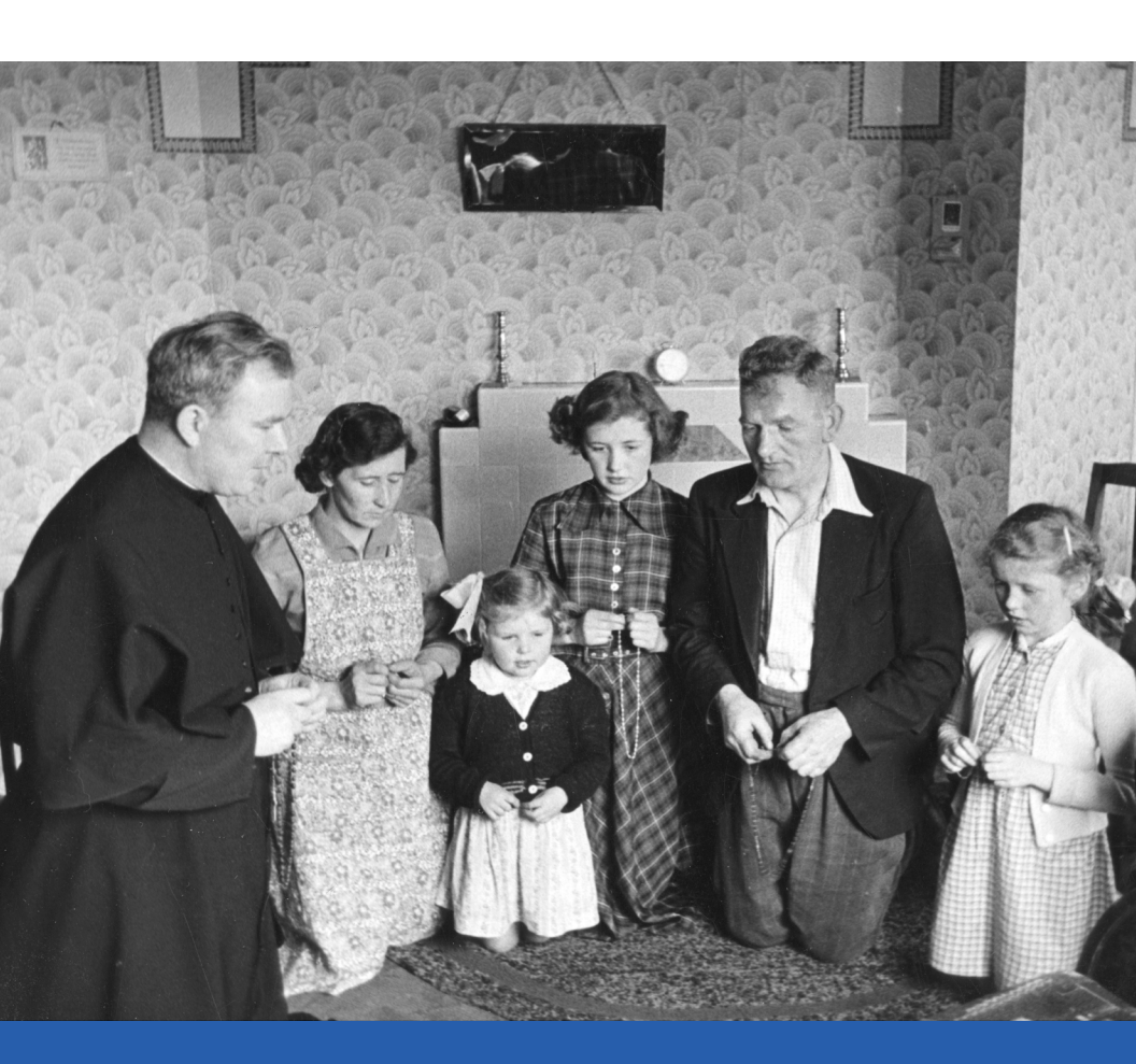
The Family That Prays Together Stays Together