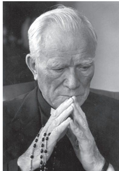
Venerable Patrick Peyton 1909-1992

In 1997, then Bishop Sean O'Malley, O.F.M. Cap., ordinary of the Diocese of Fall River, MA, at the request of the Congregation of Holy Cross, accepted competency for the Cause of Father Patrick Peyton, C.S.C. In 2001, after reviewing the life and ministry of Father Peyton, the Congregation for the Causes of Saints granted the "nihil obstat" for Father Peyton's Cause and conferred upon him the title: Servant of God.