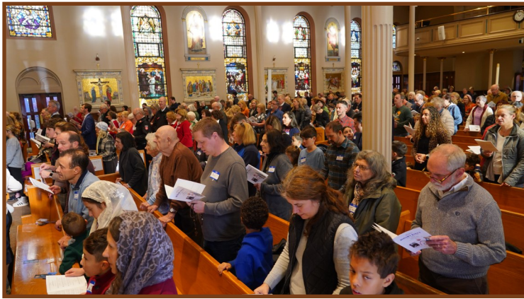
Participants gathered together to pray and to hear about the life of Venerable Patrick Peyton.

The brightness of the cathedral, both in its colors and natural light, was enhanced by the faith and hope evidenced by the many in attendance, through their piety and presence, which expressed confidence that God and our Blessed Mother hear their prayers.