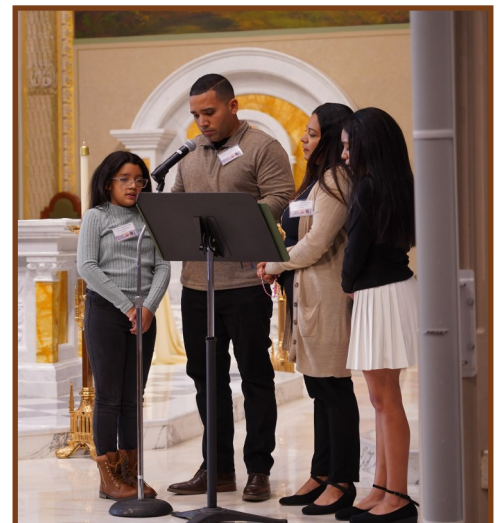
A family leads a decade of the Rosary.