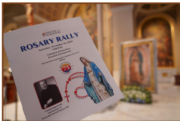
Program for the Rosary Rally held in Scranton, Pennsylvania, USA, on November 16, 2024.