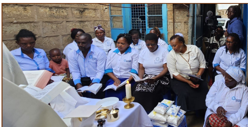
Celebrating the Holy Eucharist at the residence of the founding member of the Guild in Dandora, Kenya.

They report, "Two members have solemnized their marriage in the Church and five youths from Self Control P.P.G. have completed catechism classes and now are receiving the Holy Eucharist. Also, through prayers offered, many have testified the sick being healed, children being reformed, and financial breakthroughs."