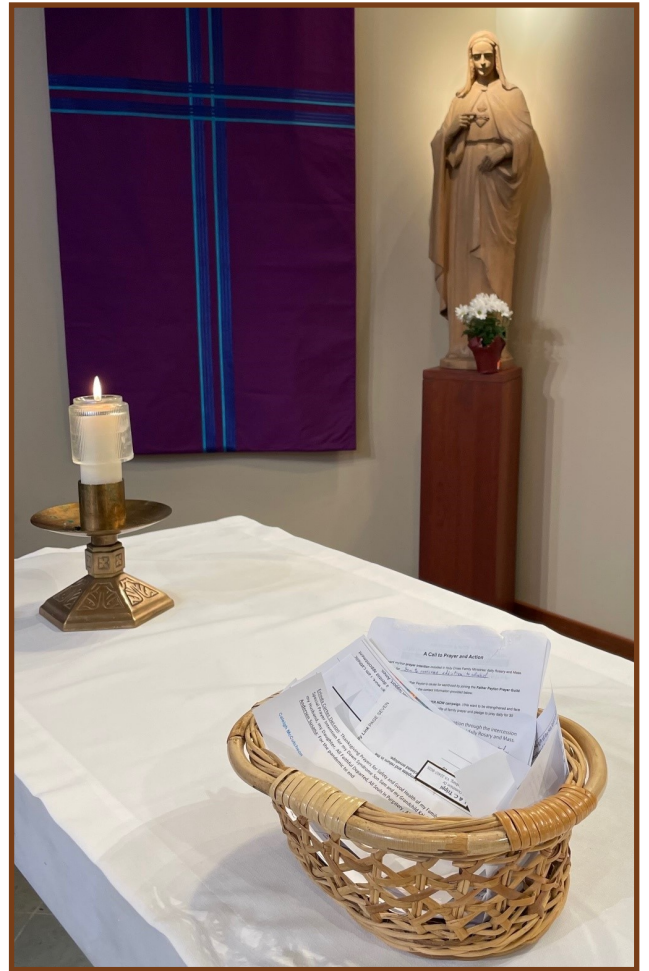
Prayer slips requesting the intercession of Venerable Patrick Peyton at the Our Lady of the Holy Rosary Chapel.

P.S.: Extra copies of the Family Novena booklet can be downloaded at: FatherPeyton.org