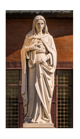
The family that prays together stays together FAMILYROSARY.ORG